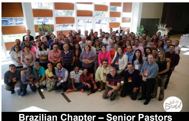
Brazilian Chapter – Senior Pastors