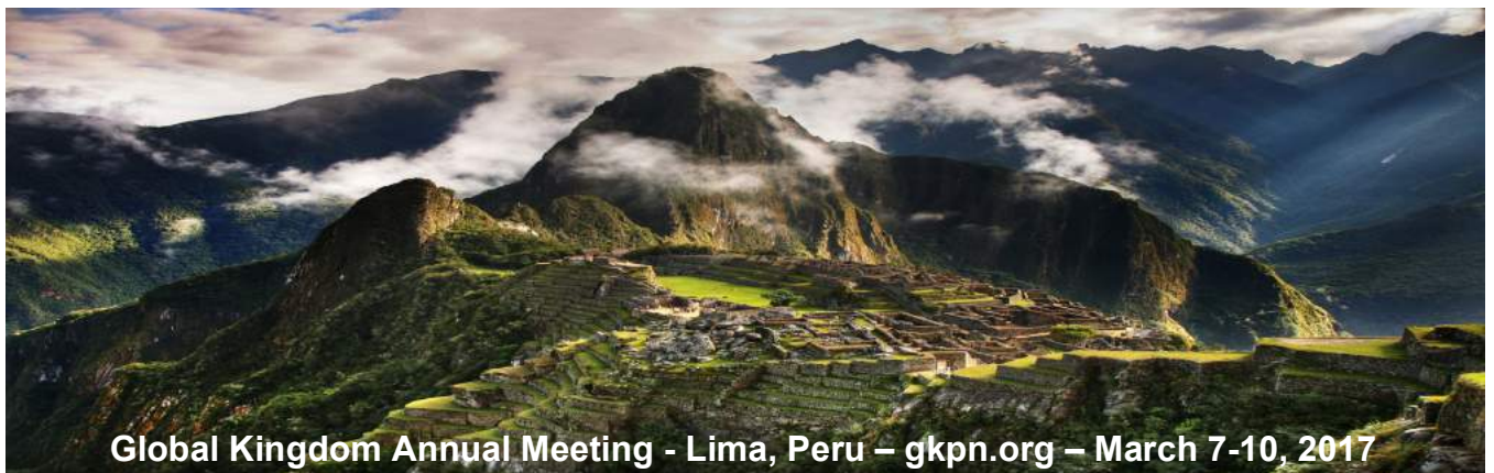
Global Kingdom Annual Meeting - Lima, Peru – gkpn.org – March 7-10, 2017